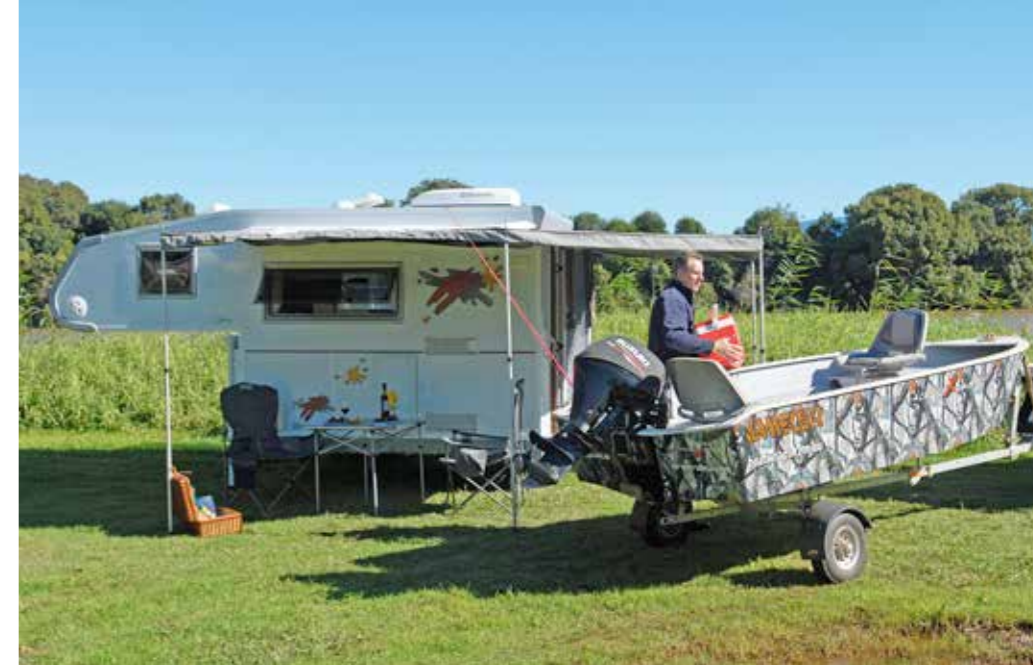
The Ozcape slides off allowing you to camp and have access to your vehicle.

Entering the rear of the camper the bathroom is on the immediate right. Fitted with a Thetford cartridge toilet it also has a hot and cold shower, the hand rose for which extends from the vanity basin. The walls are smooth making for easy cleaning and with the airy window open the hand rose may be passed through for washing