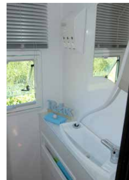
An easy to clean bathroom.

sand and dust off the body before coming inside, should you need.