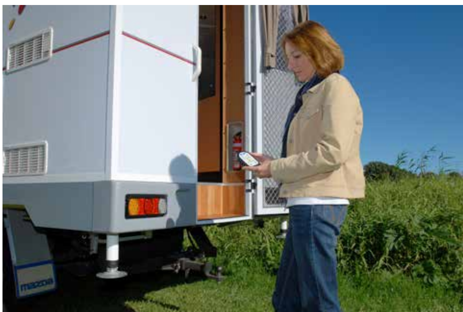
The remote control for the electric legs is handy.