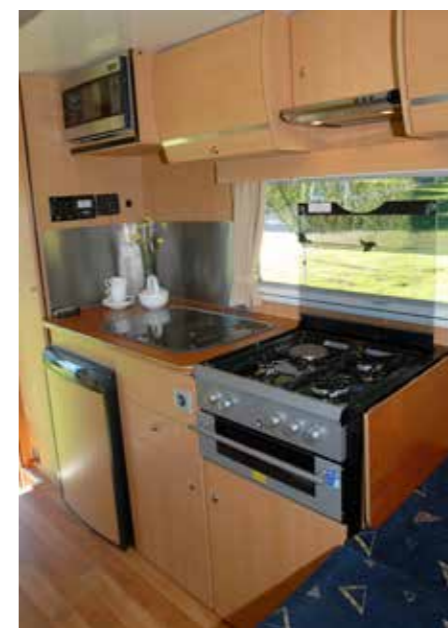
The kitchen is well appointed.