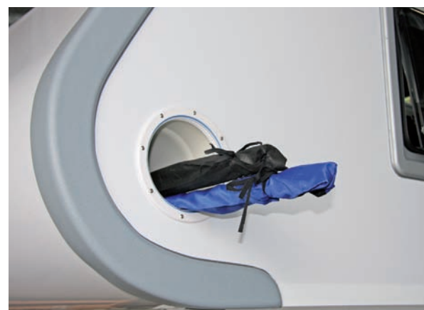
Specific requests are well catered for, like this tube mounted rod holder.