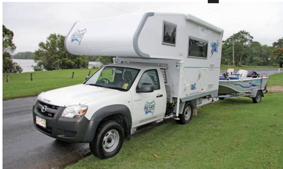
The Ozcamp slide on camper offers the complete package for travelling anglers; a comfortable camper that also allows a boat to be towed.

The concept was so interesting that I have since made a point of checking out the extent of the slide-on camper market. There are quite a number of excellent