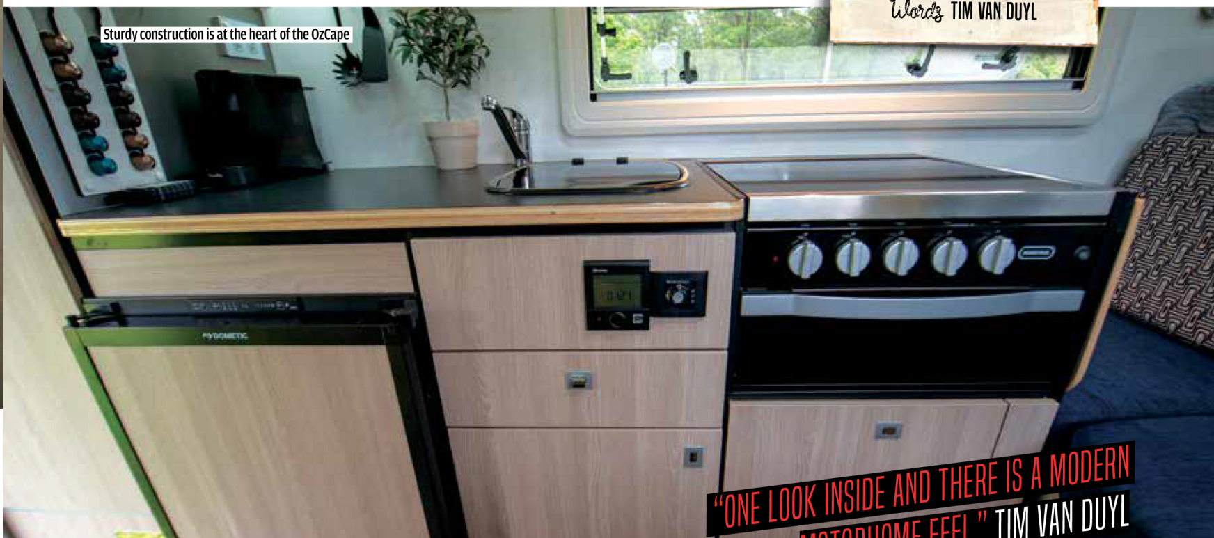
Sturdy construction is at the heart of the OzCape