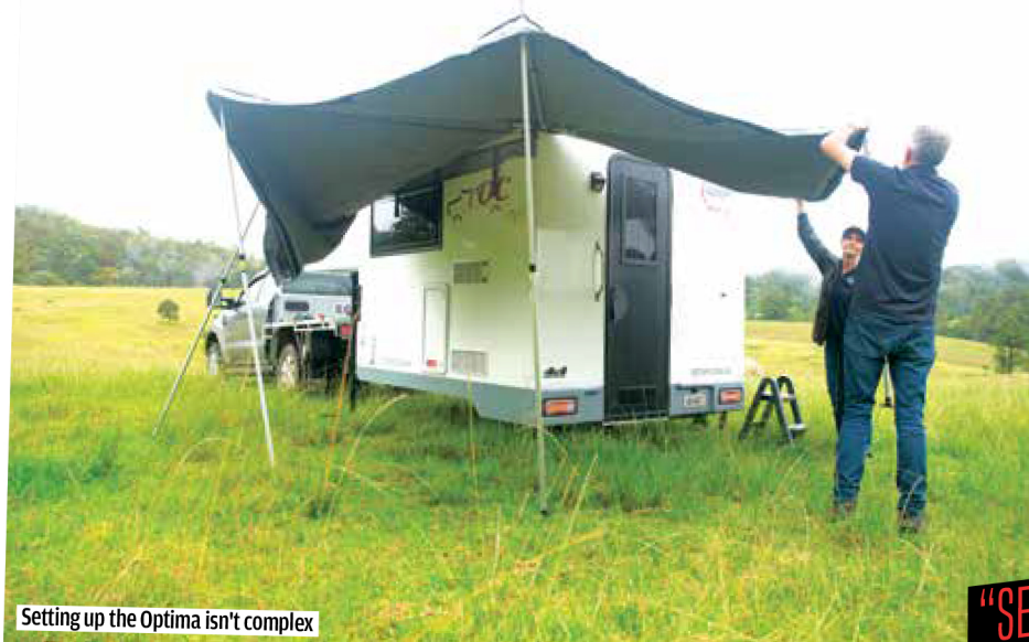
Setting up the Optima isn't complex

"MORE VERSATILE THAN A MOTORHOME AND SIMPLER TO OPERATE THAN MANY CAMPERS, FROM TOP TO TOE THE OZCAPE IS A QUALITY CONTENDER." KATH HEIMAN