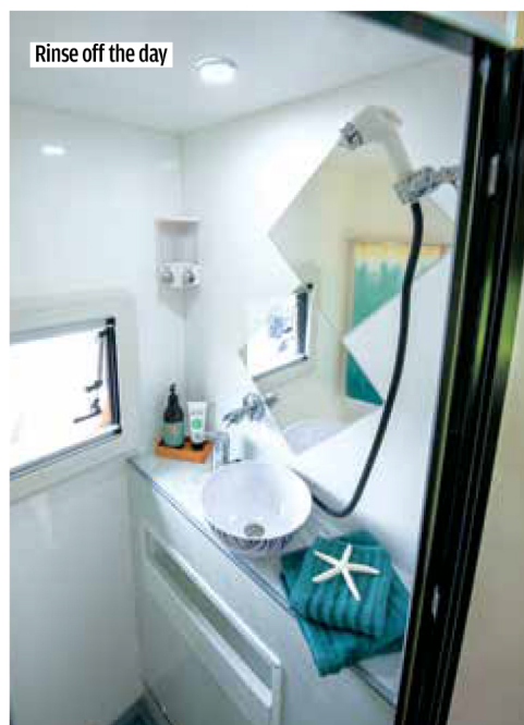
Rinse off the day

The overall design is well balanced, with the centre of gravity just 790mm from the front of the camper unit so that it comes close to the vehicle's centre of gravity, to prevent overloading of the rear axle and to keep weight on the front end for braking and steering control.