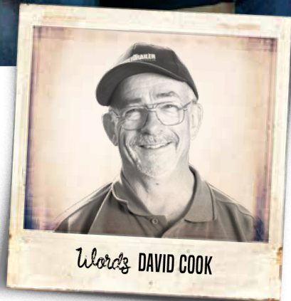
Words DAVID COOK

One of the prime aspects of the Optima's offroad capability is its sturdy construction. It's built around a