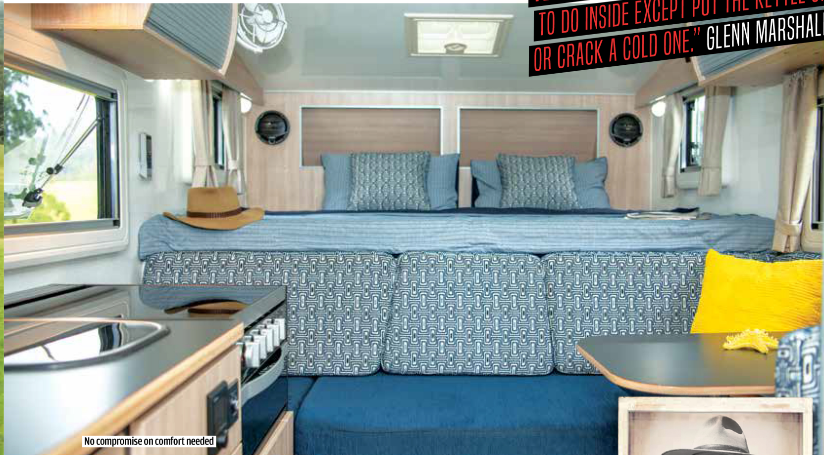
No compromise on comfort needed

"SET UP IS SIMPLE, PARK AND LEVEL THE VEHICLE AND YOU'RE DONE, WITH NOTHING TO DO INSIDE EXCEPT PUT THE KETTLE ON OR CRACK A COLD ONE." GLENN MARSHALL